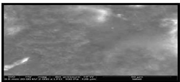
Figure 2: Scanning electron microscopic images of plaque on orthodontic e-chains subjected to Group B.

The surface characteristics of Group A showed slightly shrunken and coarse appearance but no appreciable change in the morphology of bacterial cells as presented in Figure 1. The plaque samples subjected to Group C showed intact cellular structures with coaggregation as in Figure 3.