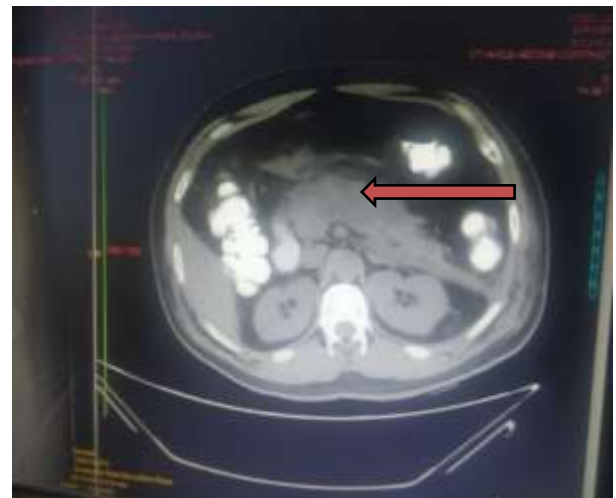
Figure 2: Patient’s contrast-enhanced CT scan at the level of splenic vein, which shows pancreatic parenchyma appears bulky. Few non-enhancing necrotic areas noted in uncinata process, head and body of pancreas. Findings are consistent with acute necrotizing pancreatitis (modified CTSI score 8/10).

Patient did not have any significant past history and any concomitant medications were not used. Clinical and Radiological findings suggested that pancreatitis occurred after taking vaccine. Also, we rule out all possible causes of pancreatitis. Hence it is not possible to establish a direct causal relation between vaccination and pancreatitis. However, this report can be used to alert practitioners to the rare possibility of necrotizing pancreatitis after COVID-19 vaccine.