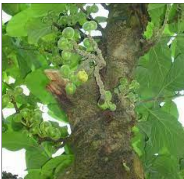
Figure 1: Ficus hispida .

The present epoch requires a modern biologically active remedy molecule, who exhibits therapeutic activity, so as to increase the large spectrum of medicinal usages.