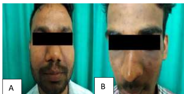
Figure 1: (A) Hypopigmentation and (B) TI.

Average cost for treating ADRs per patient (497.00 INR) is very higher than average cost of TCs abused per patient (78.00 INR). It concludes that 72% of cost was increased for treating ADRs instead of treating the disease.