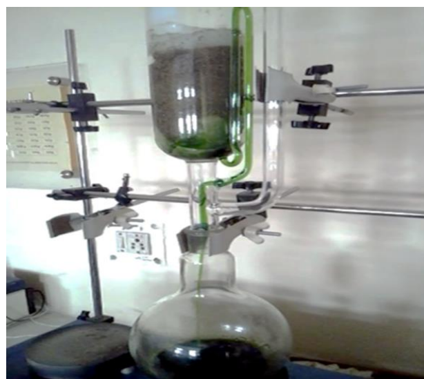
Figure 1: Soxhlet extraction for the extract.

The plant materials were washed thoroughly with water to free from extraneous impurities if any and allowed to dry on a drier table at room temperature under shade for 2 weeks. The dried stems were then pulverized into fine powder in an electric mixer grinder and the powder was stored in airtight containers. Sufficient quantity of the powder (60 gms) was then subjected to extraction process with 300 ml of 100% methanol using Soxhlet apparatus with the heating mantle set at 65^{\circ}\text{C} (Figure 1). After a reflux of 3 hours, the mixture was filtered using a Muslin cloth and subsequently with filter paper to obtain a fine filtrate. The filtrate was evaporated for a few hours to remove the residual methanol using a water-bath at 65^{\circ}\text{C} . A brownish paste like material was obtained which was collected in glass petri dishes (Figure 2). The extract material is then subjected to vacuum desiccation.