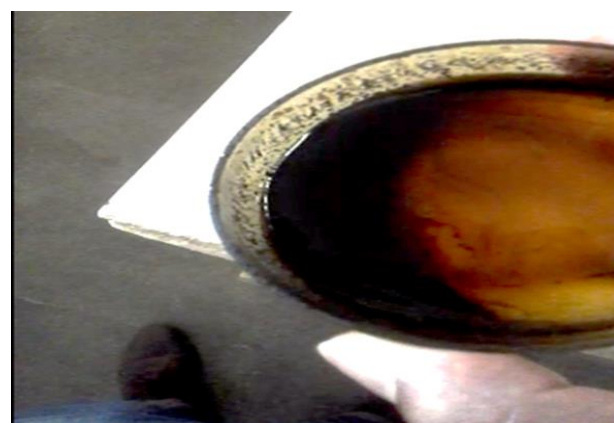
Figure 2: Brown paste like extract.