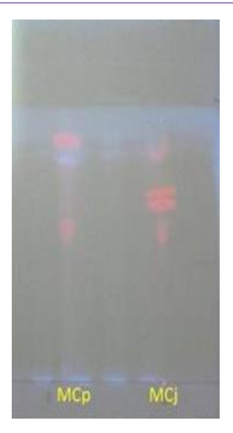
Figure 1: Thin layer chromatography of MCp and MCj.